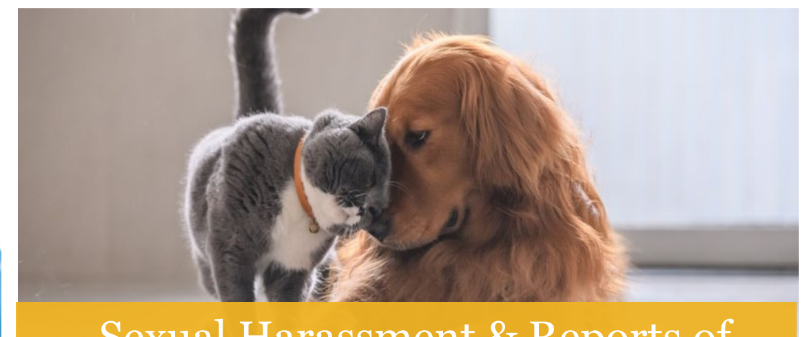
Sexual Harassment & Reports of Abuse or Neglect